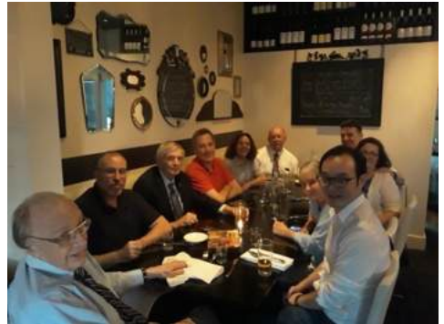
dinner with a seminar speaker