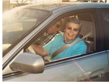
Leaving the party