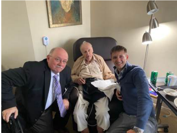
Albuquerque, Mar. 22., 2023