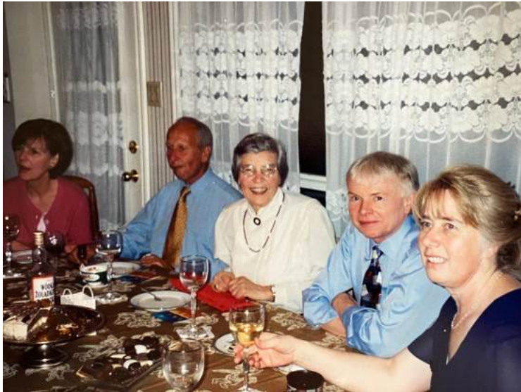
In our home around 2005