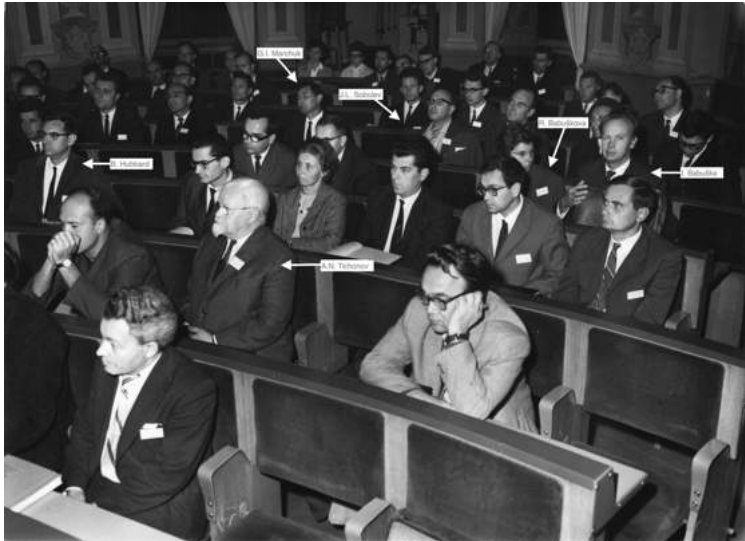
One of very rare meetings attended by mathematicians from East and West