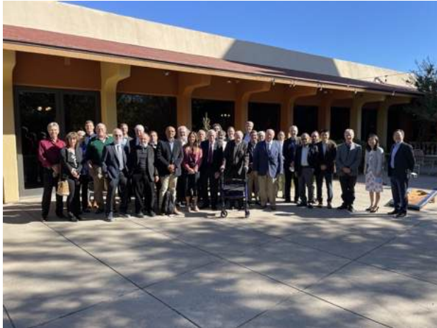
Albuquerque, Sep. 2021