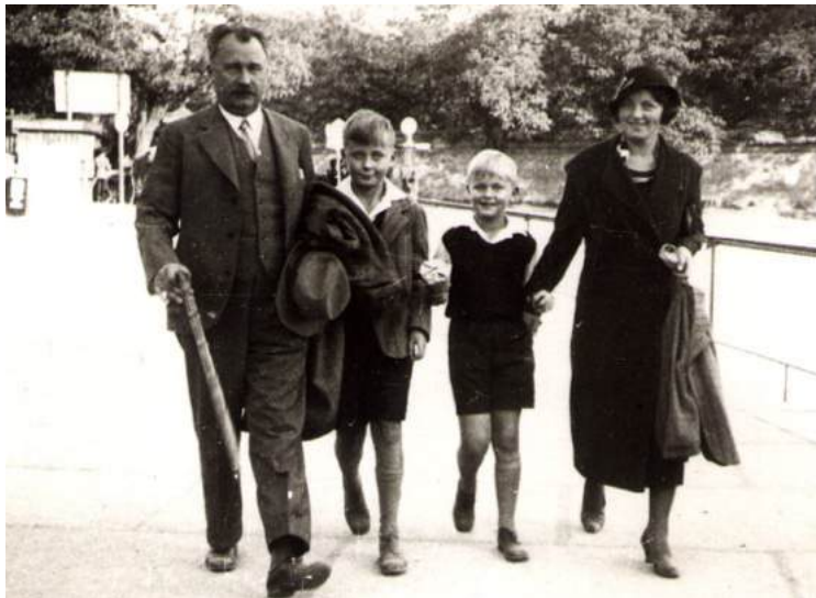
Visiting Prague ZOO with parents and brother