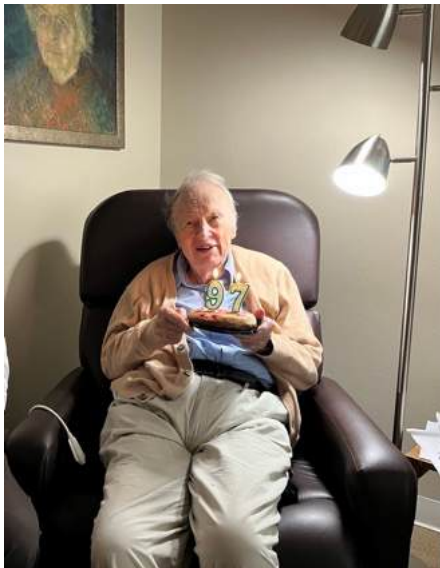
Albuquerque, Mar. 22., 2023