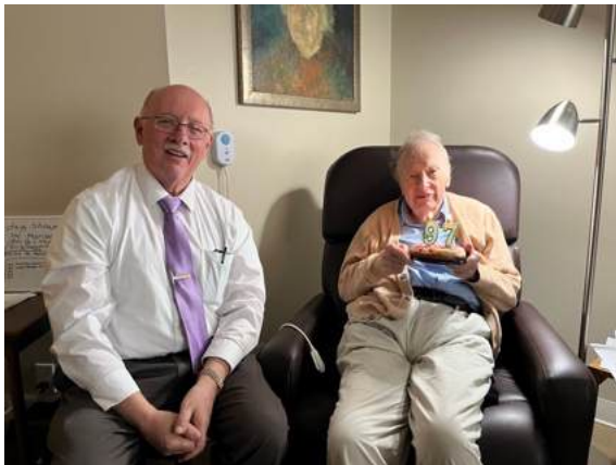
Albuquerque, Mar. 22., 2023