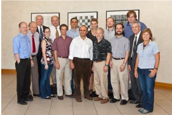
after an ICES seminar